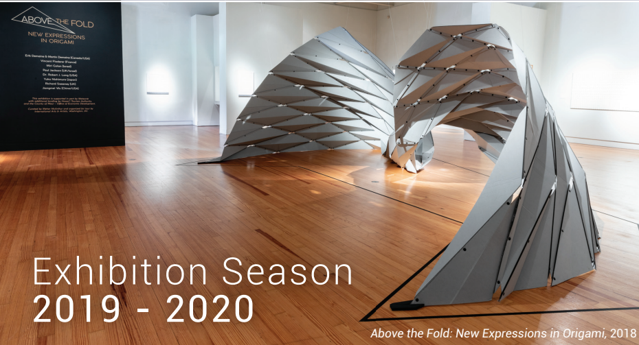
Above the Fold: New Expressions in Origami, 2018