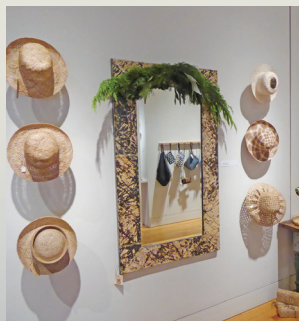
Uniques Gallery Gift Shop, 2016

Indulge in our popular holiday gift shop with a selection of art, gifts, and goodies for all of the special people on your shopping list. Finely crafted furniture, soaps, potions, knitted warmies, yummy treats, wearable art, ceramics, and jewelry will be among the finds, along with an assortment of small-scale and affordable art pieces by Hawai'i artists.