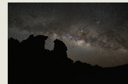
Stan Honda, Lava, Haleakalā , 2019, photography

The night sky landscapes of New York-based photojournalist Stan Honda show the beauty of the sky in relation to the Earth as it moves through the universe with a multitude of celestial objects. He has worked as an artist-in-residence at six national parks, including Haleakalā National Park on Maui. This exhibition will highlight his recent work of Haleakalā and other works from the night skies project.